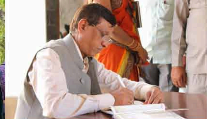
DR. BHANUBEN NANAVATI COLLEGE OF ARCHITECTURE for Women