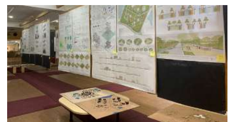
ADP Exhibition of 2023