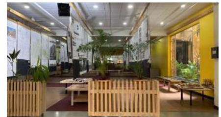
ADP Exhibition of 2023