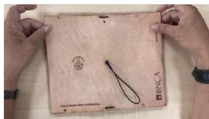
The customized diary cover