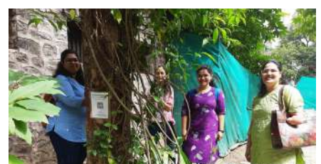
Landscape students- tree tagging activity