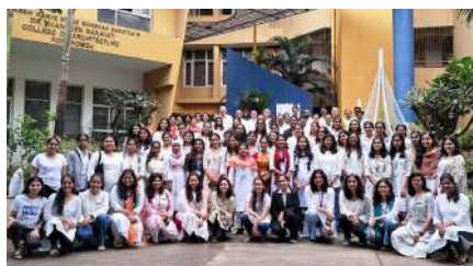
Student and Faculty on 15th August 2023