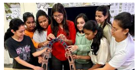
M. Arch Digital students doing the activity

Building a paper catenary arch was a creative and engaging ice-breaking exercise conducted on induction days for students of M. Arch Digital Architecture. Students got to know each other while working together on this fun and educational activity.