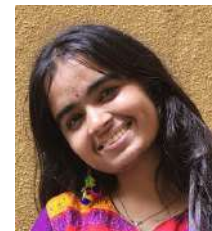
Khushi Mantri Backstage