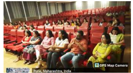
Faculty and students at the Principals address

On the first day, students of all the disciplines gathered in the square courtyard over a tea session, after which a guided tour of the MKSSS campus was conducted with a visit to the Samadhi and zopdi and a tree walk for students, after which they