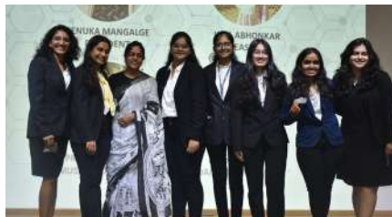
Badging of Kaladhaar heads

The students proudly displayed the badges with the promise of fulfilling all duties associated with their respective positions in the students council, that has a strength of 121 this academic year.