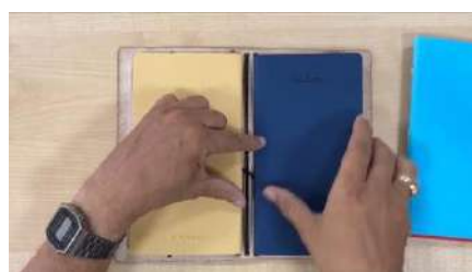
Assembling the writing pages