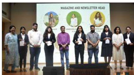
Badging of Newsletter heads

The architectural design project ADP thesis exhibition hosted by BNCA exhibited top thesis projects of the fifth-year students. This exhibition aimed to address the social, cultural, political and economic aspects through the designs. Panels of 16 students that were put up, intended to begin a discussion about impact of architectural interventions, their need and the way forward.