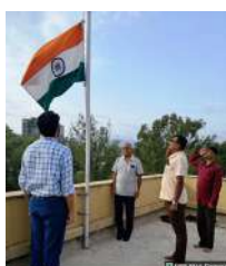
Har Ghar Tiranga pictures