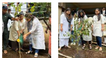
Tree plantation activity