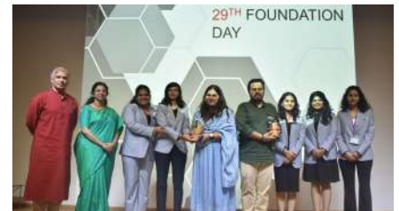
Badging of General Secretaries

The panels exhibited different building typologies and represented cultural, structural, recreational, political restatement and emerging technologies for evolution of built environment through the projects. The outreach exhibition was a medium to understand and start a dialogue about potential of design to address various aspects of built environment, cities and their socio-cultural interrelationships.