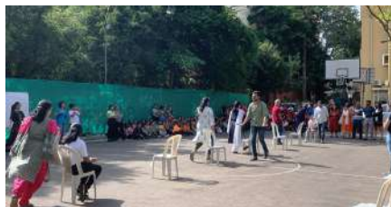
Faculty playing the musical chairs