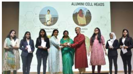
Badging of Alumni heads