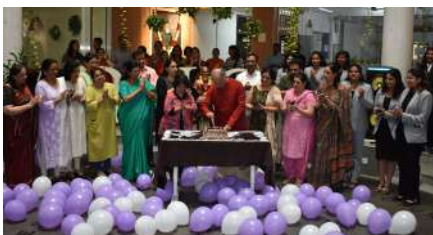
Cake cutting ceremony

After this, everybody made their way to the auditorium where the