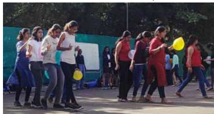
Students playing the balloon chain

The event commenced with the pledge of team spirit and to follow a healthy lifestyle. Students participated enthusiastically in this event. The cheers from the sidelines added more excitement to the games. The heart of Sports Day was the musical chairs for faculty. It was a reminder that sports can bring people together, promote a healthy lifestyle, and instil values that contribute to personal and national development.