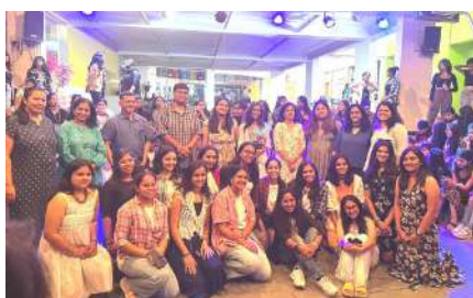
Faculty and students at the freshers party

Freshers 2023 for the new batch of BArch. was organised on 10th March, 2023.