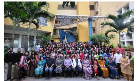
Faculty and students at the Farewell party

Parents were formally invited for the farewell party. An invitation was sent to all faculty to be present and to