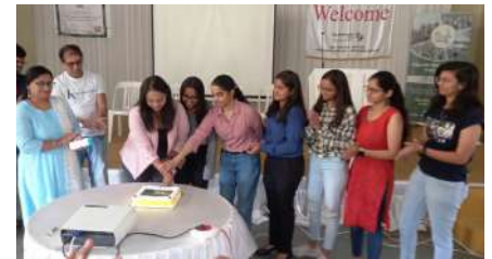
BNCA students cutting the cake

Celebrating 09 Years of Vanaja Club BNCA : Photography Exhibition and Talk session