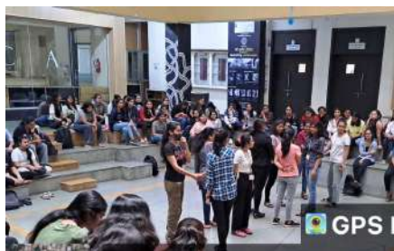
Gender Sensitivity Workshop

On 11th March it was A Div followed by B division students of all years on 18th March, on 25th March for C division and lastly on 1st April'23 for D division students of all years. The venue for all sessions was the BNCA Square Courtyard.