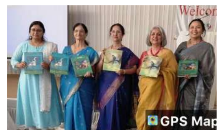
The speakers of the Talk Session