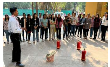
Fire fighting Safety system demonstration

Emergency evacuation is the urgent immediate escape of people away from an area that contains an imminent threat, an ongoing threat or a hazard to lives or property.