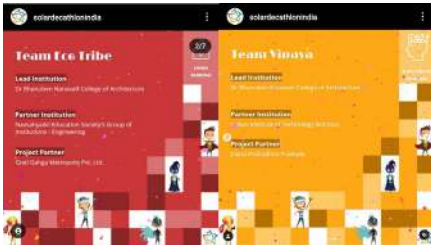
Team Eco Tribe & team Vinaya