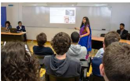
Presenting at the Indo-Portugal seminar