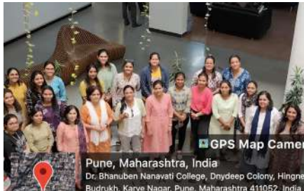
Attendees with the Guest speaker

LA forum is an event organised by the Department of Landscape Architecture, BNCA, Pune.