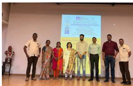
Emergency Evacuation Operation Committee