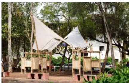
The entire structure put together

material was given before the actual hands-on workshop started. Prof. Sayali Andhare led a theoretical discussion about bamboo as a wonder grass. After that, the participants received instructions on how to operate various tools, including an axe, hacksaw, and drilling machine. They were also taught and instructed to make columns for the structure using these machines. On the second day of the workshop, participants were shown and given instructions on how to use these tools to create the structural elements like columns and trusses. Participants also learned about line out and laying of foundation, building and erection of columns.