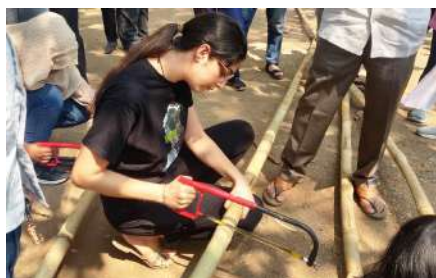
Students taking a hands on experience

An overview of the various bamboo construction techniques, joineries, and benefits of bamboo as a building