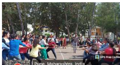
The tug of war activity

On the third day the students were introduced to the campus by conducting a guided campus tour. The structure Cell conducted a tug of war session in the basketball court after a short talk in the courtyard.