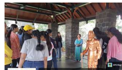
Paying respects at the Samadhi

The faculty conducted theatre activities and workshops with activities based on creative and cultural aspects.