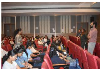
Class Teachers introducing the students to college rules and system