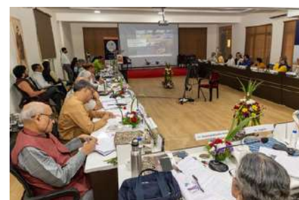
The conference in full swing

We must recognize the problems we see in Bharat as those of 'humanity'. CSOs are living organizations- an active, pulsating part of the whole, and we must lead the whole to achieve its purpose. Well, a lot needs to be discovered, debated and re-created. A series of events are being planned in small and large groups. The intention however is agreed upon by all to showcase the 'Bharatiya' view of development-the one that we have been putting into practice for thousands of years! We look forward to all parts joining together to make this journey 'whole' and thus fulfilling.