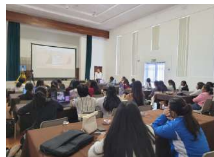
The workshop in progress