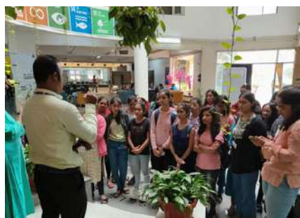
Election officials with students at BNCA

The students were made aware about the electoral process, their duty to vote and about the Constitution of India.