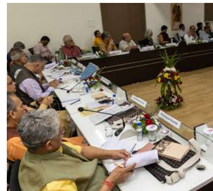
The sessions in full flow

During the discussions, we acknowledged the legacy passed to us over thousands of years by our ancestors-the deep meaning of duty based society and how true development begins inside self and not outside. The cumulative experience in the room crossed centuries and spanned across diverse areas like Agriculture, economics, trade architecture, natural resource conservation; yet a singular thought shone through: we must take the opportunity of the G20 leadership to refine or even re-define the current ideas and narratives about development.