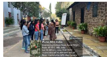
Visit to the Zopdi