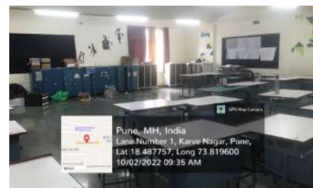
The classroom before the 'clean up'

Therefore a clean-up activity at regular intervals is a must. This activity was done to make the classrooms a cleaner and healthier space to grow and study.