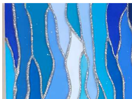
Two of the the outputs of the assignment

The students were asked to download a melody of 2min of their choice and then analyse the melody based on Pattern, Time period, Intensity, Pauses, Colour, Texture, in between spaces, Mood, Frequency and then and identify the element and principle of design to be used to