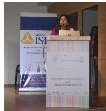
Hon. Smt. Poonam Mahajan speaking post the National Symposium at BNCA

of the SDG hub of 2021-22, followed by her speech. She mainly spoke about the importance of policy making in the execution of a project. Giving an example of the Swachh Bharat Abhiyan she talked about the process that is actually involved in making sure that the a government project reaches every citizen of the country.