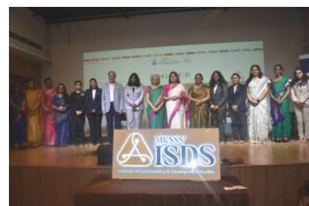
Hon. Smt. Poonam Mahajan with all dignitaries and students of SDG Hub 2021-22

Her talk had the audience spellbound as she narrated her own childhood experiences and the subsequent learning and how all those experiences are an inherent part of her work. She also spoke about how her entire team is an “only-women” setup and how they are achievers who are together for a cause. Prior to the valedictory function, she humbly paid her respects at the Anna Karve Samadhi.