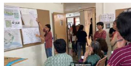
Jury being conducted in the class room

The rest of the students were expected to see the juries of their classmates as well as the juries of students of other academic years and were allowed to visit and watch juries in any and every classroom.