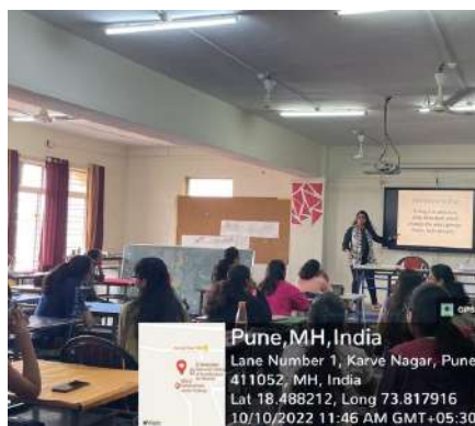
Drug Awareness Program being conducted for the students

A Drug Awareness Program was conducted in 12 classes of BNCA for 480 students as an NSS initiative 10th October 2022 in the BNCA Campus. A drug is a substance, other than food, which changes the way a person thinks, feels and acts. The goal of program was to contribute to a safer community through coordinated efforts to prevent use and treat dependency of drugs. The fact that drug abuse is preventable and that drug addiction is a treatable disease, was stressed upon.