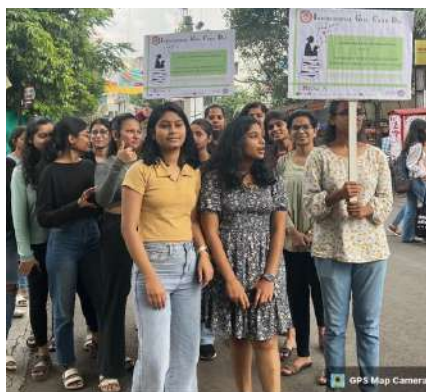
BNCA students in the Awareness Walk

On the occasion of International Girl Child Day, MKSSS's BNCA organized an Awareness Walk for Girl Child Education. Students of BNCA enthusiastically participated in this event. This walk took place in Hingne gaon on 11th October 2022 around 12:45 PM during the lunch break.