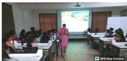
The workshop in progress

A workshop on Auditory skill on music in Architecture was conducted for the BNCA ADD students by Dr. Sanjeevani Pendse on 4th and 6th Oct 2022.