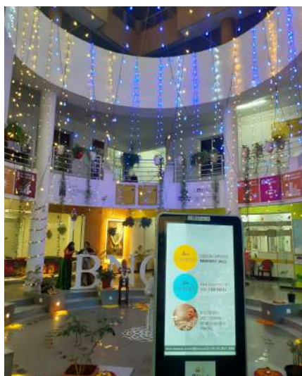
Decorations for Deepotsav

created in the Deepotsav activity, to the girls of MKSSS's hostel who would rarely get something by post. This little effort will surely bring some joy to these young girls. As darkness descended the whole campus stood out with the lamps which brought out the essence of Diwali