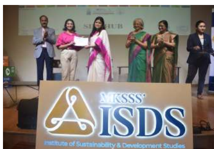
Hon. Smt. Poonam Mahajan felicitating the students of SDG Hub 2021-22

On 4th October 2022, Hon. Smt. Poonam Mahajan graced the valedictory function of the National symposium on Sustainable Development held in BNCA ..The valedictory ceremony of this symposium included the felicitation