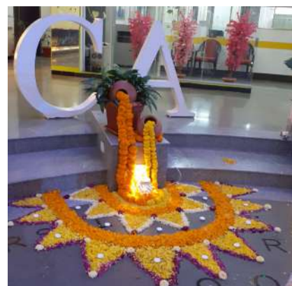
Decorations for Deepotsav

Maharshi Karve Samstha and all its constituent colleges celebrated Deepotsav on Wednesday 19th October evening at 05.30 PM. BNCA students decorated the premises with flowers lanterns and lamps ready to be lit. All faculty and students were invited for this event. Classes started late that day from 10am and continued till 4.30pm. From 4.30pm, the Deepotsav activities started with abstract lantern making where all B.Arch, M.Arch and CAID students worked on making one lantern per class.