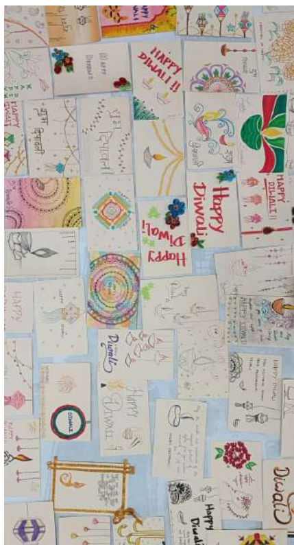
Collage of Postcards made by students and Teachers

created in the Deepotsav activity, to the girls of MKSSS's hostel who would rarely get something by post. This little effort will surely bring some joy to these young girls. As darkness descended the whole campus stood out with the lamps which brought out the essence of Diwali