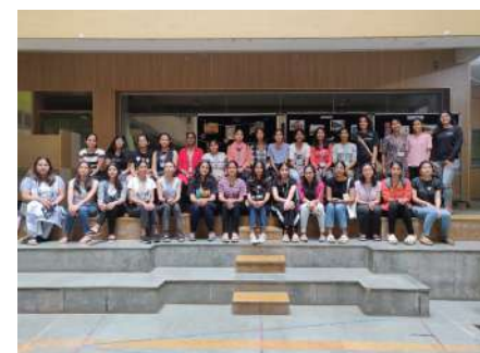
The NSS Tidy-Up Team