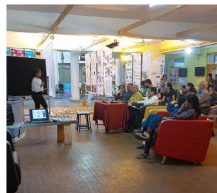
Mega jury in progress in the courtyard

13 students from each class were shortlisted by the design team of every class for presenting their work to the jury, from which one student was nominated for a special open-courtyard jury. There were a total of 144 students nominated for class