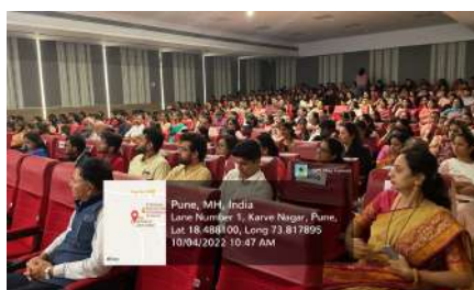
The audience in rapt attention