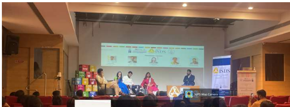
The first panel participants for the National Symposium on Sustainable Development

On 4th October 2022, under the aegis of ISDS - Institute of Sustainability and Development Studies and in collaboration with SDG Hub, UNFCCC Hub, Millennium Fellowship, BNCA, a National Symposium on Sustainable Development was held in BNCA on the topic of Sustainable Development. It consisted of two panel discussions on the topics of Youth Action and sustainable development goals (SDGs) and Current Challenges and SDGs.