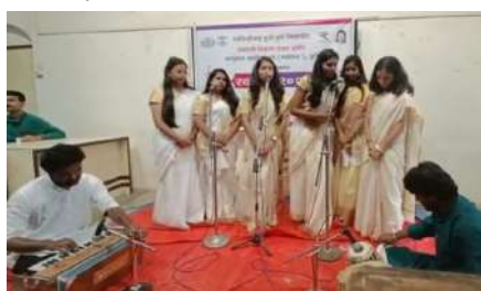
BNCA group song team