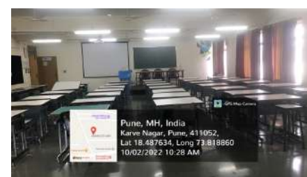
The classroom after the 'clean up'