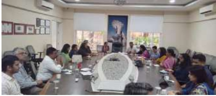
Employers Day- interaction in the BNCA Boardroom

Dr. Bhanuben Nanavati College of Architecture for Women (BNCA) in Pune took a significant step in bridging the gap between academic knowledge and the practical needs of the architecture and construction industry on October 9, 2023.