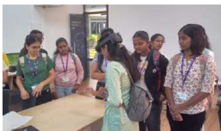
Students experiencing the AR-VR lab