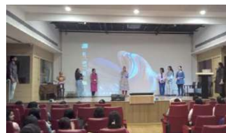
Session with first year class teachers

The fourth day of the induction program started with understanding the LMS (learning management system) for the college where