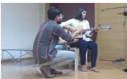
Showcasing student's skill sets

Post lunch, the students were allotted divisions and sent to their own classrooms for an informal interaction with their faculty.