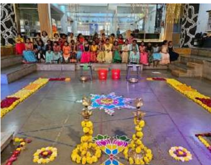
Kumarika Poojan Decorations

As per the custom followed every year during Navratri, BNCA had organized the Kumarika Poojan Ceremony on 20 th October 2023 on the occasion of Durgashtami at the BNCA premises on the ground floor, from 4pm to 6pm. Faculty and staff were requested to bring along their daughters below ten years of age for the poojan ceremony.