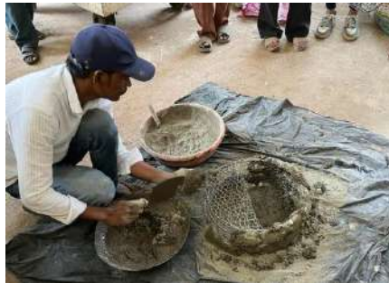
Ferrocrete technology demonstration

The reinforcement cage with the weld mesh and chicken mesh was kept ready well in advance. The skilled ferrocrete labourers first