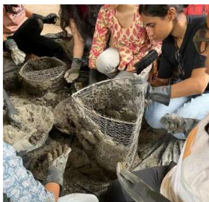
Students working on planter type 1