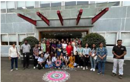
Ferrocrete structure at Wai