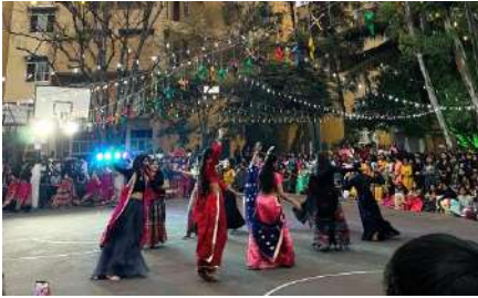
Students enjoying the Dandiya

Dance Event at the MKSSS Basketball Court on October 20, 2023 from 4:30 pm to 7:30 pm. With the Kumarika poojan and Garba events, the whole premises was bustling with activity and dandiya beats.