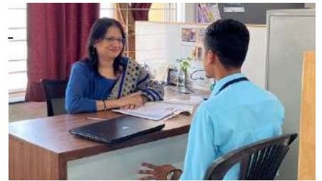
Employers Day interviews

It exemplifies the commitment of BNCA with John Moores University, the British Council, and industry leaders to the development and growth of the architecture and construction sector.