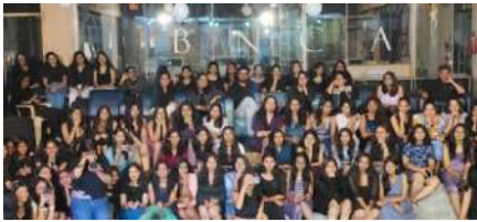
The host and guest batch- 1 st and 2 nd year

The Freshers' Party for the year 2023 was organized on the evening of 27 th October 2023. Hosted by second year students, the theme for this year was "Euphoria".