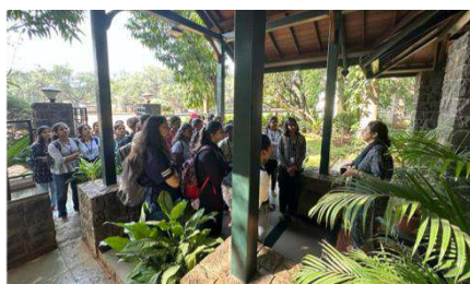
Students at Anna Karve Samadhi