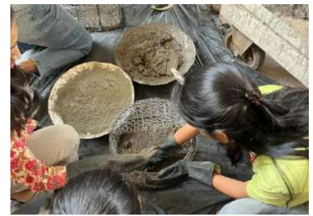
Students working on planter type 2