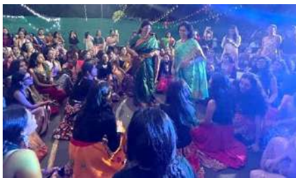
Faculty and students in the Garba event