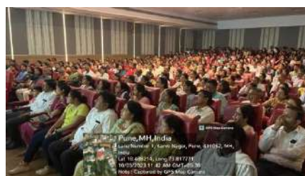
Induction Day 01 in the auditorium