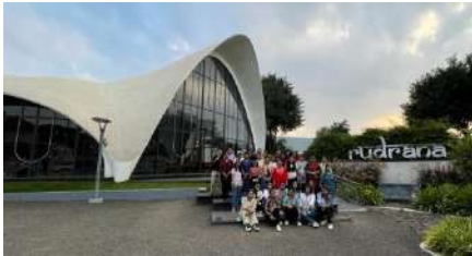
Ferrocrete structure at Wai

Students got to see and learn about pre engineered buildings. They also visited a ferrocrete structure "Rudrana Restaurant" at Wai after the industry visit.