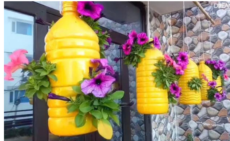
Planters from phenyl bottles

Few of the ideas are shared in this and subsequent slides for giving example