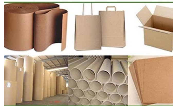
Cardboard Rolls, Cartons, paper bags etc.