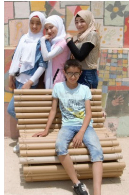
Furniture from Cardboard rolls