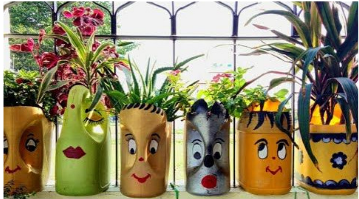
Planters from Plastic Cans