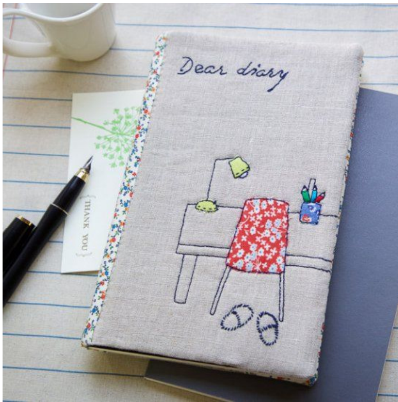
Eco friendly Diaries