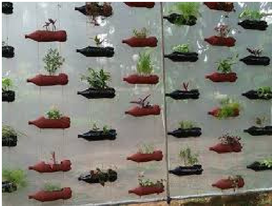
Planters from plastic bottles