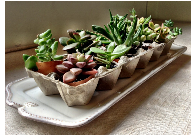
Egg shell Succulent tray