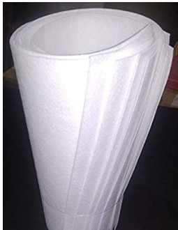
Waste Sheets and papers