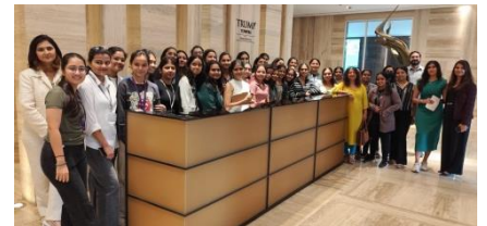
Students and teachers at the Trump Towers

Fourth year design 'Studio A' had arranged a visit to Trump towers and Yoo Pune on Tuesday 30 th July 2024 to experience Luxury Housing. 35 students and teachers from BNCA were a part of this visit.