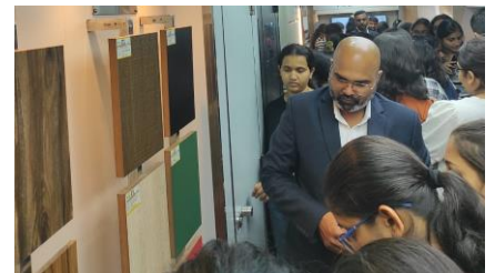
Students at the TESA Studio on Wheels

On 15th and 16th July 2024, the TESA Studio on Wheels was stationed at BNCA Campus.