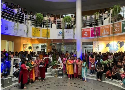
BNCA students, faculty and admin at the Guru Pournima Celebration

B. Arch, M. Arch, B. Des & CAID celebrated Guru Pournima on Tuesday 23 rd July 2024 in the BNCA circular courtyard. The event commenced with a tribute to Maharshi Karve, followed by Saraswati Poojan.