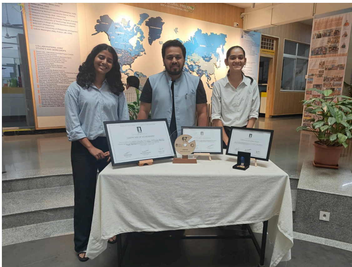
Z310 (BNCA) ACHIEVEMENTS IN THE 67TH YEAR OF NASA, INDIA

The 67th AGBM not only facilitated smooth leadership transition but also reinforced the spirit of collaboration, responsibility, and creativity that NASA India stands for. The well-structured agenda ensured efficient elections and meaningful exchanges among participants, paving the way for a dynamic and ambitious term ahead.