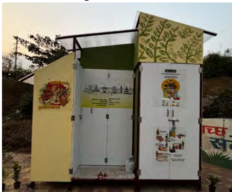
The New Design