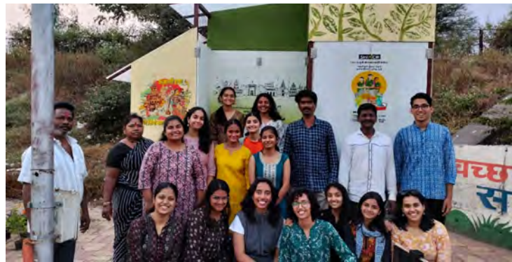
The Team with SWaCH Members on Inauguration Day.