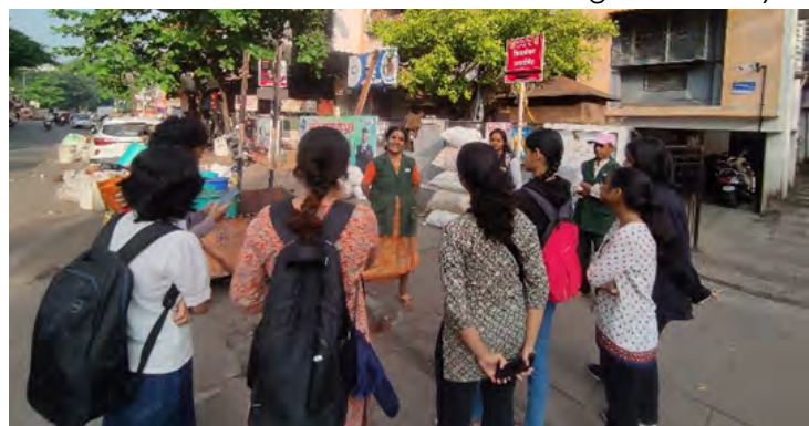
The Team interacting with SWaCH Members.