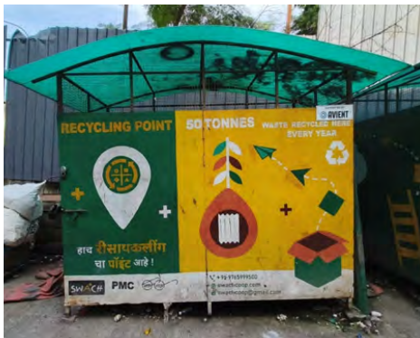
The Old Design